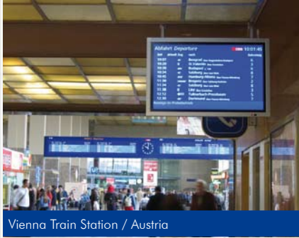
Vienna Train Station / Austria