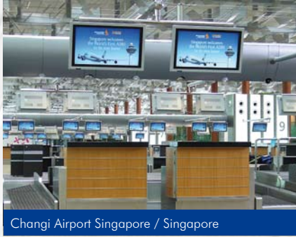
Changi Airport Singapore / Singapore