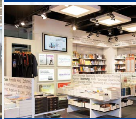
Book shop Hollmann, Duesseldorf / Germany